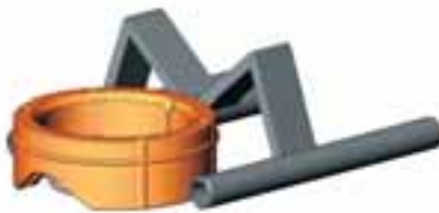
Sleeve and cylinder mount

The convenience and accuracy of Betaflex technology now available to users of steel backed plates, laser ablation elastomers, and sleeves of all types