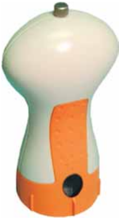
Standalone operation for flat plates, prints, and films